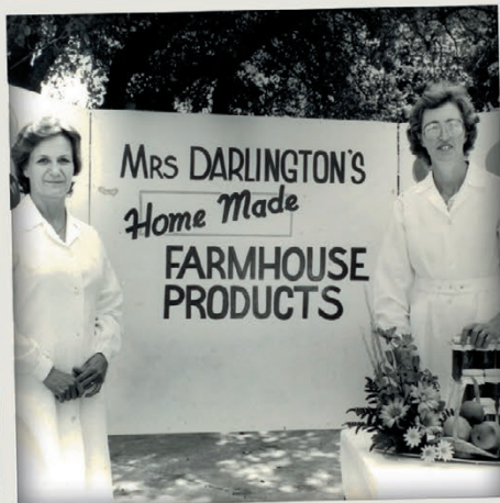
Audlem fête 1981