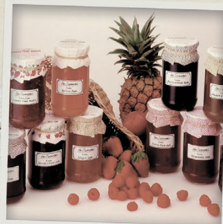
Back in the 1980's!