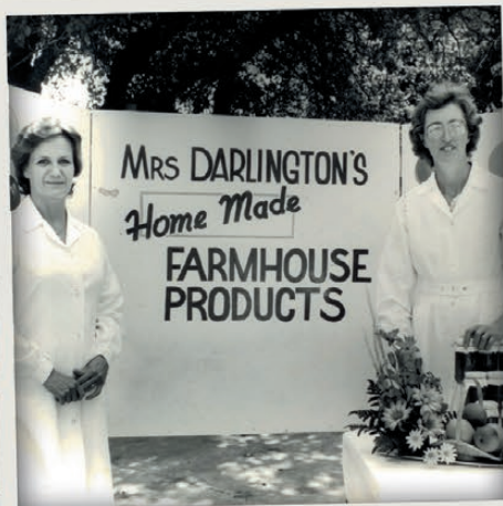
Audlem fête 1981